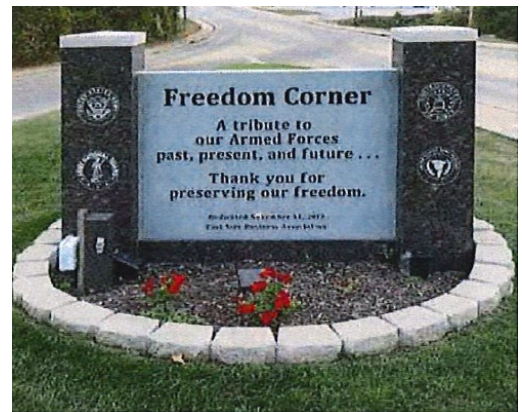
Freedom Corner Veterans' Tribute at McCarty and High Street

In 2013, East Side Business Association adopted the right-of-way space at the intersection of E. McCarty and E. High Streets, with the intent to upgrade the Armed Forces Tribute erected in 1976 marking 200 years of service. We named the new veterans' tribute "Freedom Corner," in recognition of the service and sacrifices endured by veterans, past, present and future to preserve the American Way of Life.